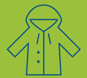
WARM JACKET/ RAINCOAT (Winter)

ALSO BRING THESE ITEMS IF STAYING OVERNIGHT AT THE POTBERG ECO-VENUE