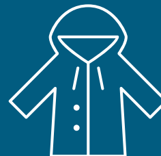
WARM JACKET/ RAINCOAT (Winter)