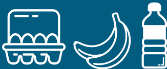
FOOD + DRINKS